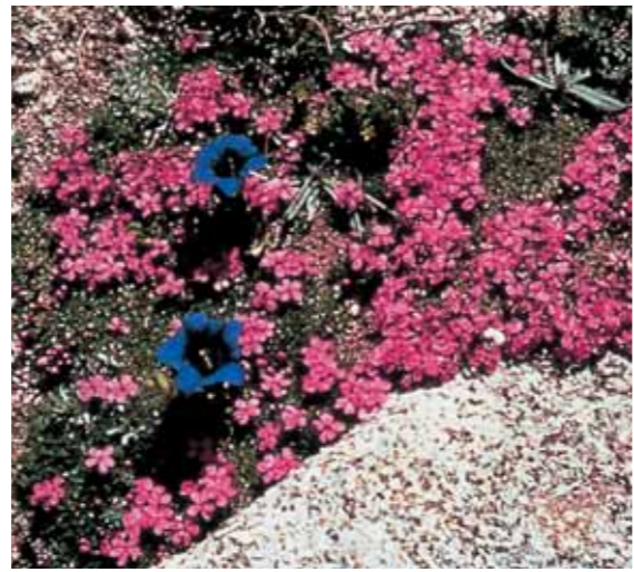
Alpine gentian and moss campion