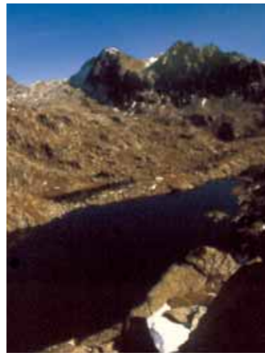
Estany de Tumeneia and the Travessani needles