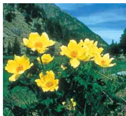
Alpine flowers adorn the landscape.