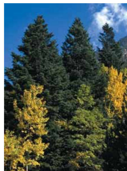
Fir and birch make a striking contrast.

The mountain pine holds out up to the tree line.