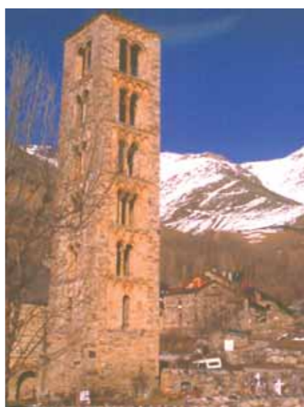
The Church of Sant Clement, Taüll.

Cultural aspects. The National Park is part of a zone with a rich cultural heritage. The villages of the Pyrenees have always been defined and constrained by their geography: a ruthless mountain terrain which has hindered both external and internal communications, and a harsh climate which has limited human settlement to small villages in close proximity to one another. Few remains can be found from Palaeolithic or Neolithic times. It is not until the Bronze Age that we start to find traces of these valleys' inhabitants, while Romanisation advanced no further than the Aran Valley. The territory is indissolubly linked to the rise of the Christian kingdoms of the Pyrenees and its architecture to the Romanesque. It was here that the first independent communities sprang up, in the form of small counties loosely linked to the county of Tolosa, which by the end of the 9th century had become the independent counties of Ribagorça (in the west) and Pallars (in the east). The Middle Ages brought with them an unprecedented cultural awakening with the advent of Romanesque art and architecture: churches with their sculptures and mural paintings, elegant bell towers, monasteries, castles, watchtowers and bridges make up a unique artistic heritage perfectly integrated within the surrounding nature.