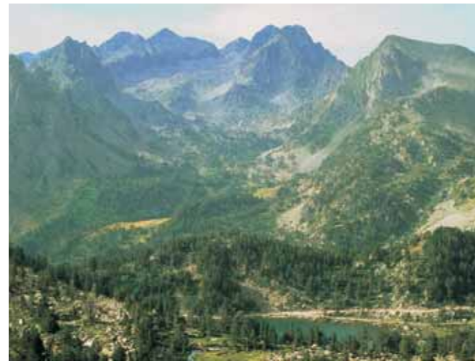
Estany de Ratera