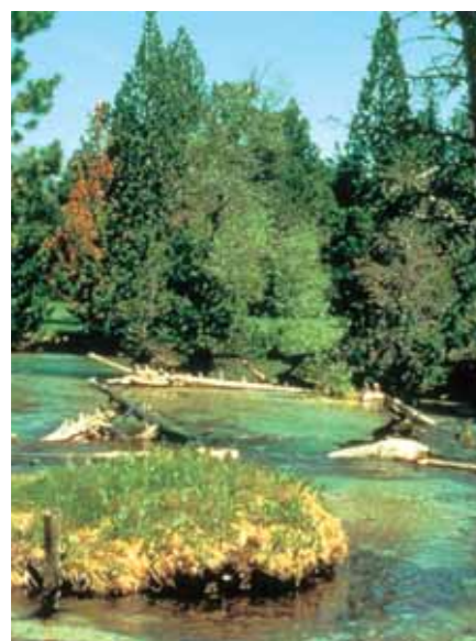
Water is present in many corners of the Park.