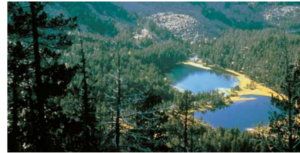
Estans de Trescuro

General information. The main entrances to the Park, in Boí and Espot, lead onto the Aigüestortes flats and Estany de Sant Maurici, respectively. However, visits can also be made to other places of undoubted interest in the neighbouring districts of Alta Ribagorça, Pallars Sobirà, Val d'Aran and Pallars Jussà. The entry of private vehicles is restricted, and all cars must be left in the car parks located at Park entrances. There are public transport services in villages within its area of influence which take passengers inside the Park. Visitor Centres. Before beginning your tour, why not call in at our Visitor Centres in Boí and Espot? We can tell you the most suitable itineraries for your fitness level and the time you have available and inform you about weather conditions and, in winter, the risk of avalanches. You can also get to know and join in with the activities and guided excursions organised by the Park, visit our permanent exhibition or watch the audiovisual presentation. You will also find books, maps, brochures, souvenirs and all the information you require on the Park and the cultural and artistic heritage of its surrounding areas.