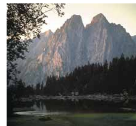
The peaks of Els Encantats are a reference point in the Park.

The mountain pine holds out up to the tree line.