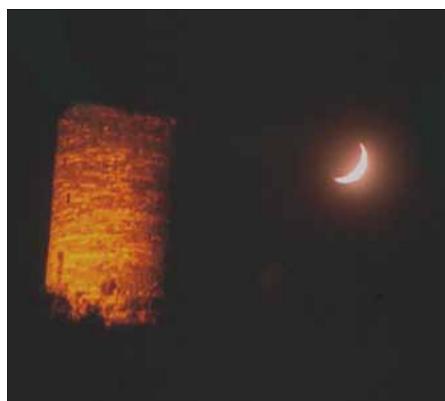
The Watchtower, Espot.

The Park is home to one of Europe's most important centres of Romanesque art and architecture.