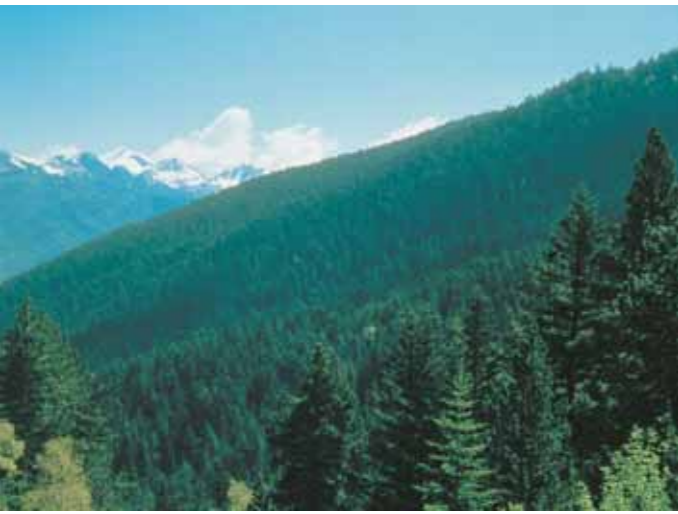
The fir forest on Mata de València